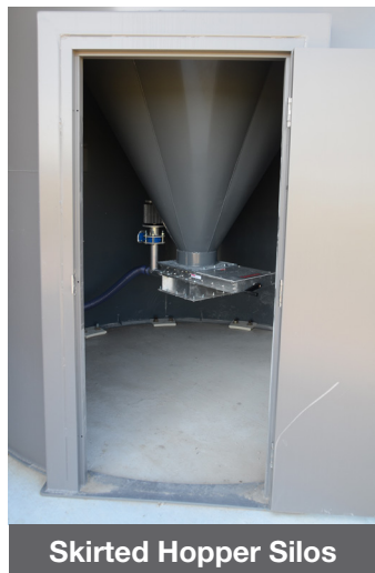
Skirted Hopper Silos