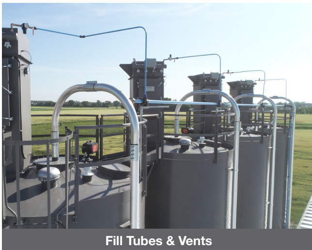
Fill Tubes & Vents