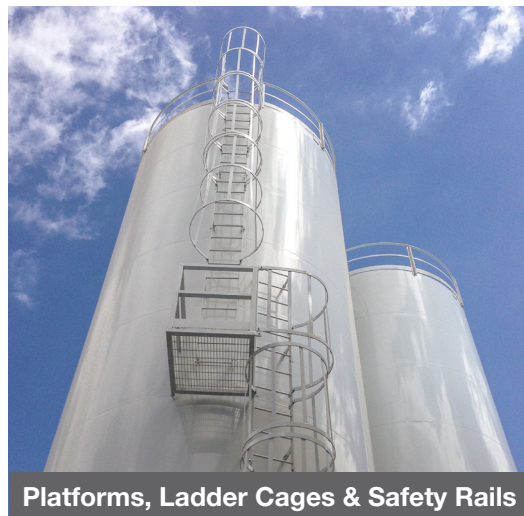
Platforms, Ladder Cages & Safety Rails