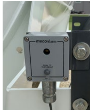
MECO OVERFILL ALARM