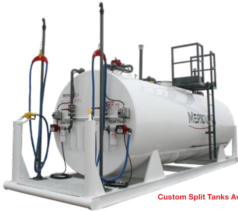
Custom Split Tanks Available