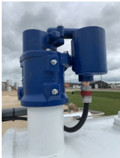
FE Petro Package STP33-VL2-0

*GPM/LPM pump volume reflects the manufacturers specifications. Flow rates can be lower due to meter, filter & hose length.