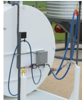
ARCTIC HOSE & NOZZLE