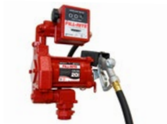
FILL RITE 701VL Package

115V AC / 1/3 HP 76 LPM / 20 GPM No meter Filter 20' of 3/4" Arctic Hose Automatic Nozzle Recommended For: 2300L – 4600L