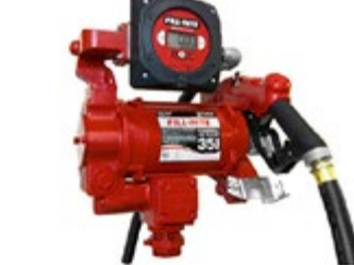
FILL RITE 319VL Package

115/230V AC / 3/4 HP 132 LPM / 35 GPM FR 901-L meter Filter 20' of 1" Arctic Hose Automatic Nozzle Recommended For: 4600L – 10,000L