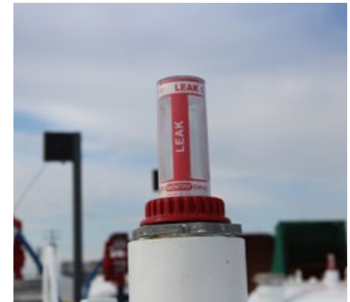
LEAK DETECTION GAUGE

Other options available. Please contact your local Meridian dealer or fuel tanks@meridianmfg.com to learn more.