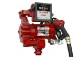
FILL RITE 311VL Package

115/230V AC / 3/4 HP 132 LPM / 35 GPM FR 901-L meter Filter 20' of 1" Arctic Hose Automatic Nozzle Recommended For: Econo Tanks 15,000-35,000L