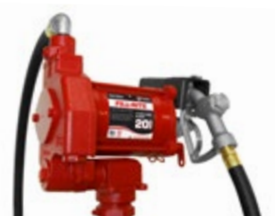
FILL RITE 700V Package

115V AC / 1/3 HP 76 LPM / 20 GPM No meter Filter 20' of 3/4" Arctic Hose Automatic Nozzle Recommended For: 2300L – 4600L