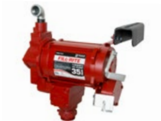
FILL RITE 310VN Package

115V AC / 1/3 HP 76 LPM / 20 GPM FR 807-L meter Filter 20' of 3/4" Arctic Hose Automatic Nozzle Recommended For: 2300L – 4600L