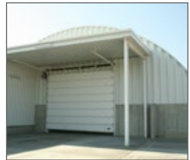
Canopy Many more options - air floor, stairs, plenums and doors.

Meridian Manufacturing hereby warrants the building materials, sold by it for the building above described, to be free from of any defect in material or workmanship under normal use and service, for a period of three (3) years.