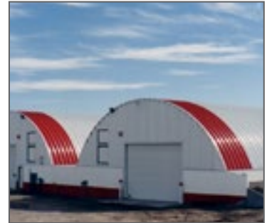
Color options for panels