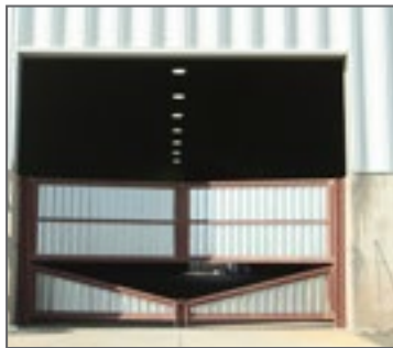
Swinging Bulk Head Doors