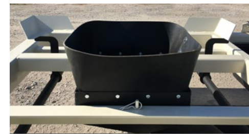
Patented Box Guides