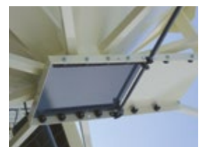
Rack-n-Pinion Slide Gate