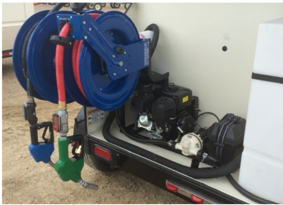
6.5hp Gas Engine, 40GPM Pump c/w 25'x3/4" Hose, Meter, Auto Nozzle, Auto Reels & 208L DEF System