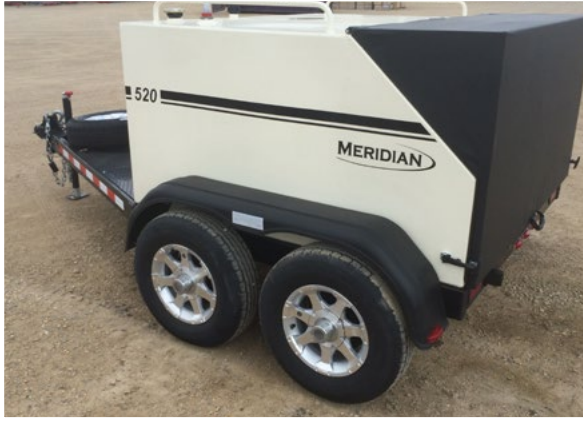
Rear Compartment Cover