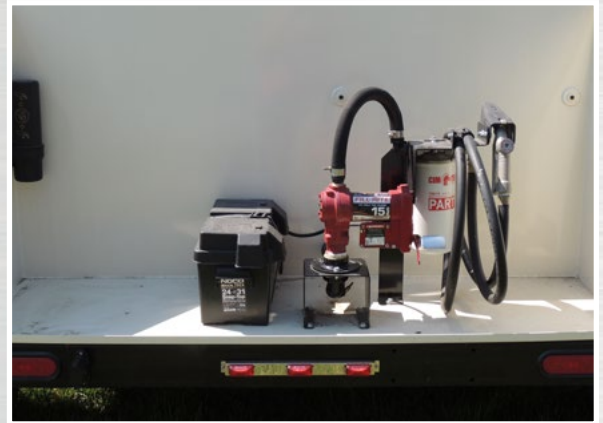
12V Fill Rite Pump, Filter, Hose & Nozzle