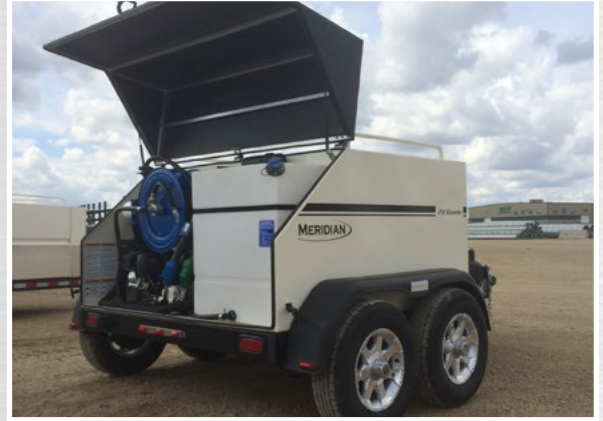
Rear Cover, Aluminum Frame, Vinyl Cover